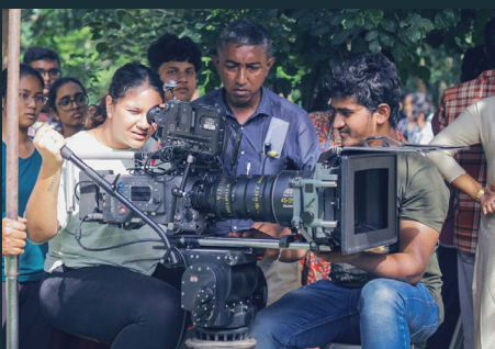
RVU students having a hands-on experience with a film camera