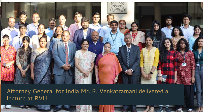
Attorney General for India Mr. R. Venkatramani delivered a lecture at RVU